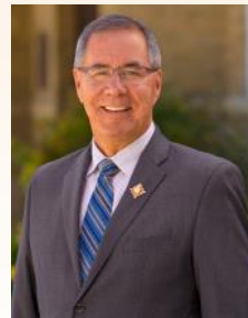
Patron Hon. Russ Mirasty Lieutenant Governor of Saskatchewan

Free museum admission. Donations graciously accepted.